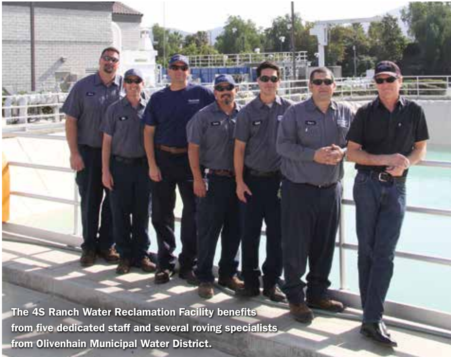
The 4S Ranch Water Reclamation Facility benefits from five dedicated staff and several roving specialists from Olivenhain Municipal Water District.