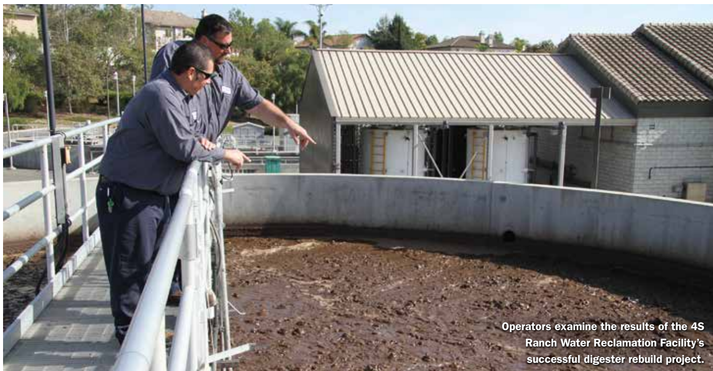
Operators examine the results of the 4S Ranch Water Reclamation Facility's successful digester rebuild project.

Finding the right balance between managing the plant with available resources and looking for small improvements plant personnel can manage themselves is like walking a tightrope.