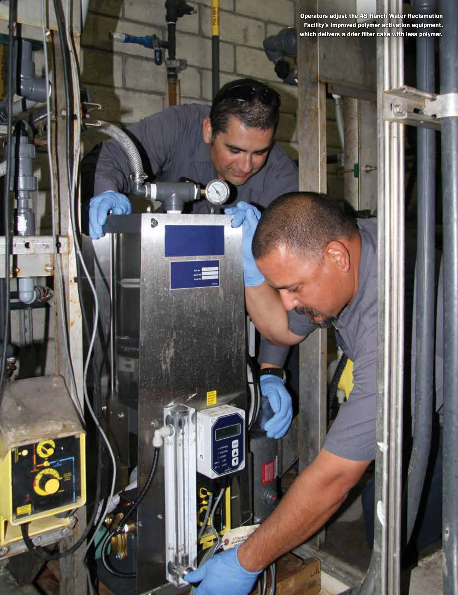
Operators adjust the 4S Ranch Water Reclamation Facility's improved polymer activation equipment, which delivers a drier filter cake with less polymer.